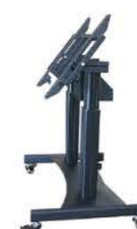
6084F Electric Lift + Electric Flip Mobile art