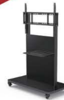
ST23C Mechanical Mobile Stand