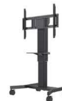
EST05 Electrical Mobile Stand