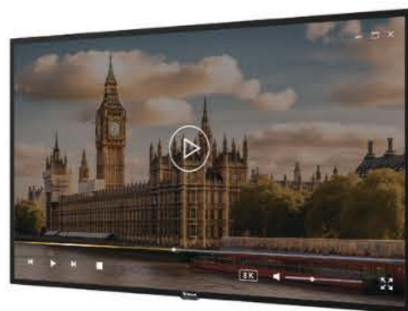
◆Support 8K video display

VT Pro Series adopts a back panel that delivers wide color gamut and low blue light. More realistic visuals, but without increasing the risk of eye damage.